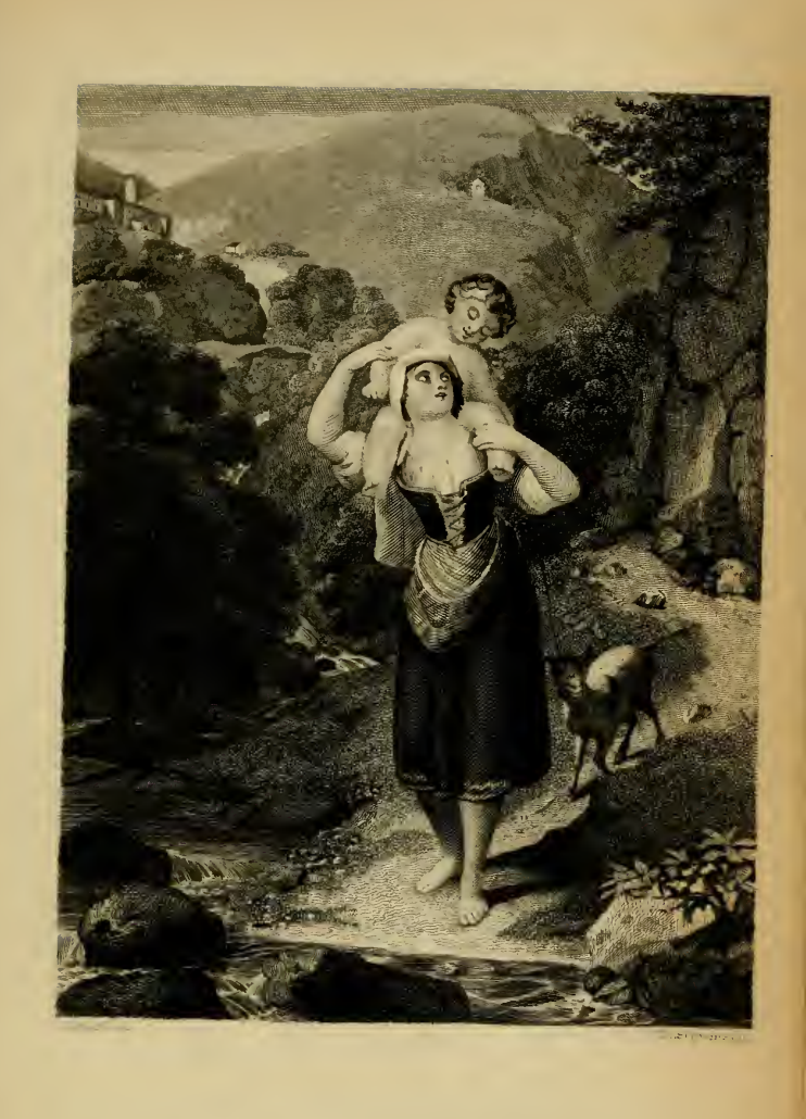
t Flat Flat Co.